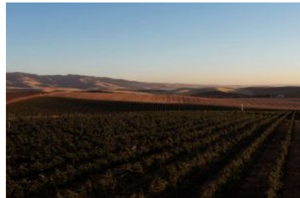
Jackson Family Wines buys first vineyard in Washington's Walla Walla Valley