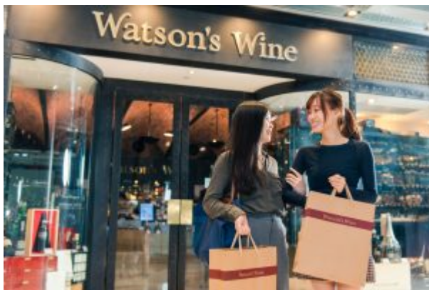
Hong Kong's largest specialist wine retailer Watson's Wine promotes DWWA 2021