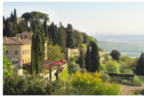
Decanter's dream destination: Rosewood Castiglion del Bosco