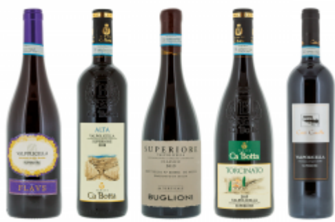
Valpolicella: panel tasting results