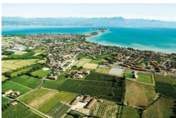
Lugana: Regional profile and 12 spectacular whites