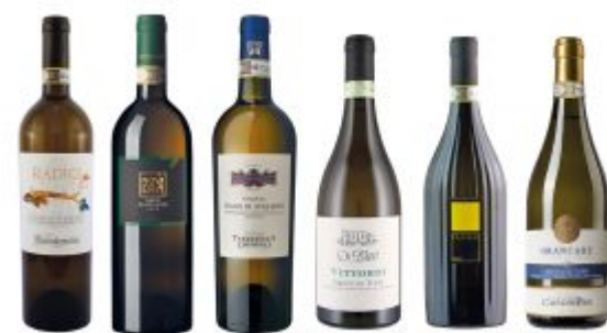
Top Campania white wines: Fiano & Greco